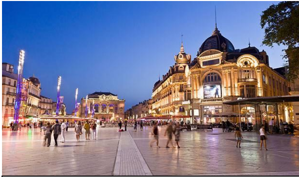
PLACE DE LA COMÉDIE, MONTPELLIER